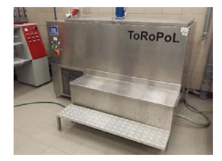
FIGURE 2. Frost resistance test chamber

Splitting tensile strength was tested on five specimens from each test group prepared in accordance with the requirements. The results of the breaking load and strength T are shown in Table 4 and the failure moment and appearance of the sample after the test are shown in Figure 4.