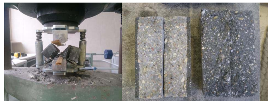
FIGURE 4. Tensile strength cracking test, sample of traditional and photocatalytic cubes after the test

conditions and pollution). Additionally, the obtained results were confronted with the standard requirements (Table 5).