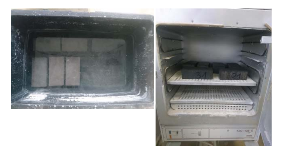
FIGURE 1. Stages of absorption testing - saturating samples, drying of samples