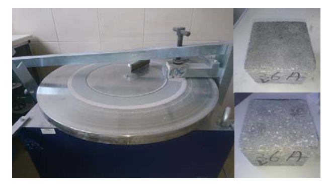
FIGURE 3. Abrasion test on the Boehme disk, sample before and after the test